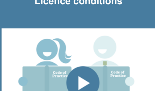
RSW Code of Practice